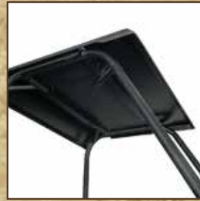
FOPS (Falling Object Protection Structure)