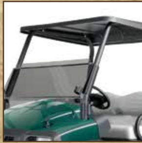
Windshield & Canopy

The XRT1550 is the industry's toughest vehicle, and with hundreds of accessories to choose from, the most versatile, too. Don't see what you need here? Ask your dealer for a complete list.