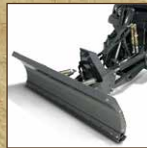
IntelliTach™ 62 in (157 cm) Plow Blade