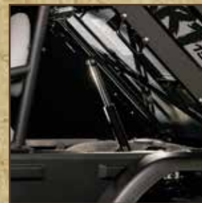
Electric Bed Lift