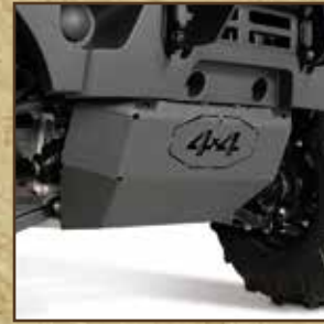
Front Skid Plate